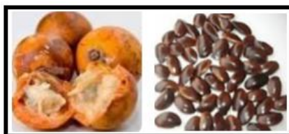
Figure 1: The African star apple fruits (left) and seeds (right)

The African star apple ( chrysophyllum albidum ) (commonly known as white star apple or African apple) is a forest fruit tree found throughout tropical Africa significantly in western, eastern and southern parts of Nigeria. It is a large berry containing 4-5 flattened seeds or sometimes fewer due to seed abortion. While the fruit is edible the seed is often discarded and randomly thrown away 8 .